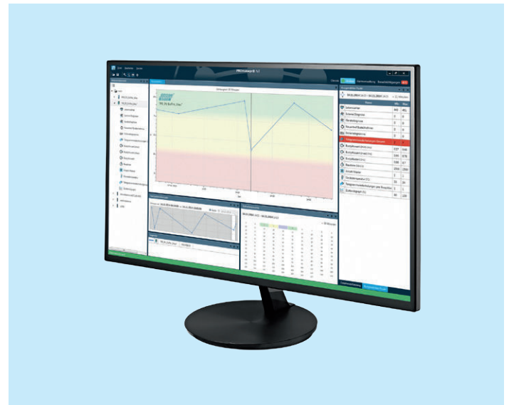
Network management software PROmanage® NT