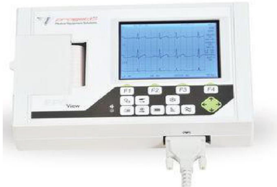
Fig.3: ECG/EKG machine